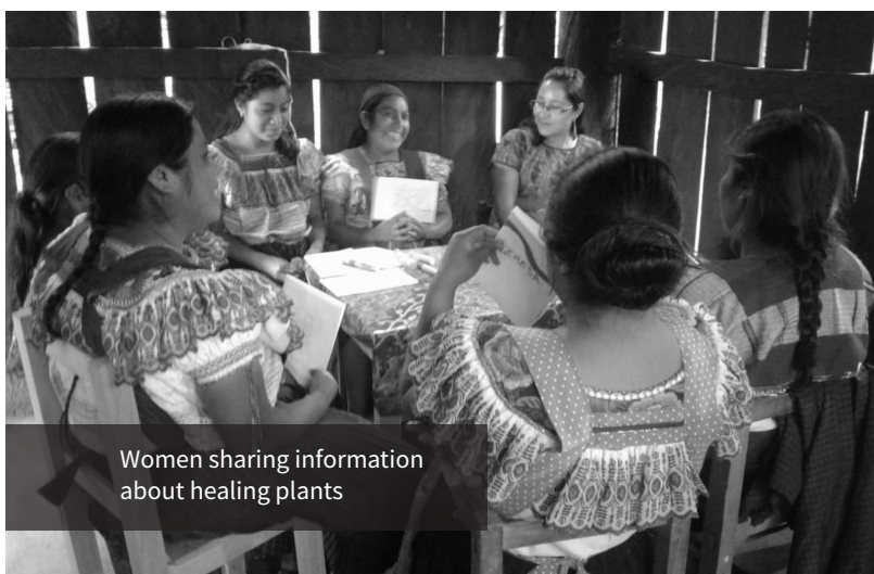
Women sharing information about healing plants

SOUTH SUDAN – New Community Project (NCP) requested grant support for a new project in South Sudan on Gender-Based Violence. Through grant support, they have been able to hold workshops and seminars for local community leaders, chiefs, women representatives, and government officials. They have held trainings for law enforcement agencies around laws which lead to violence against women, like the illegal divorce of women and early pregnancy, which can cause young women to drop out of school. Social workers have been trained in how to offer in-home guidance and counseling to victims of violence. The project is able to provide an emergency pill for those that have been sexually assaulted to stop the transmission of HIV/Aids among women and girls. Women in the local communities are so thankful for this project because it has elevated their voices in the pursuit of equality with men and in the halting of violence against women.