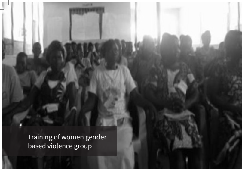
Training of women gender based violence group